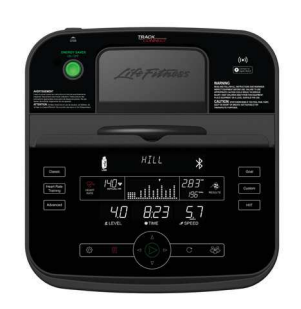
Track Connect 2.0 with Enhanced Bluetooth